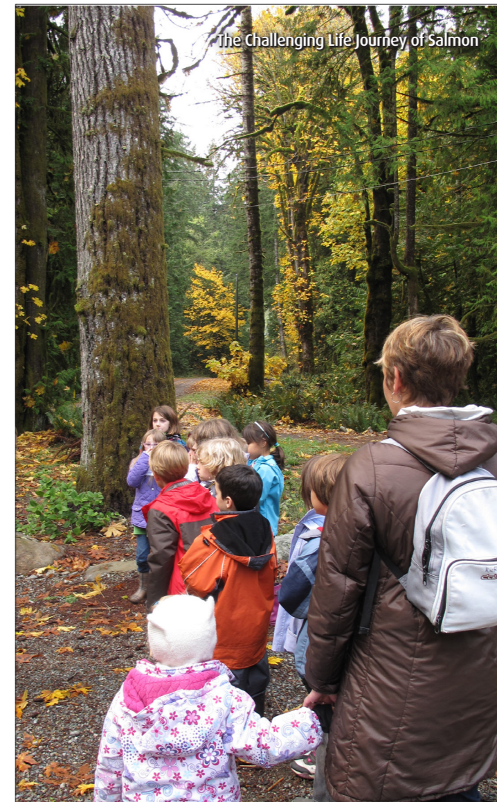
The Challenging Life Journey of Salmon