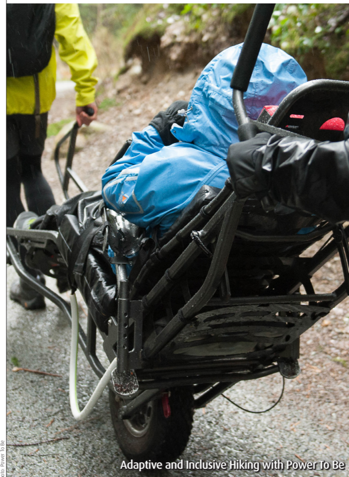
Adaptive and Inclusive Hiking with Power To Be

Trail Description: 700m; compact gravel surface; slight incline. Wheelchair accessible.