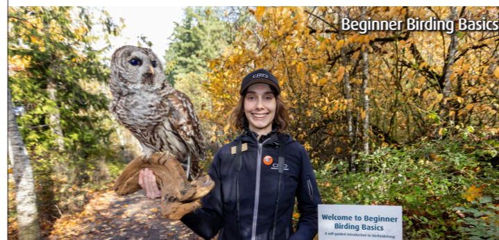
Beginner Birding Basics

Trail Description: 1km; compact gravel surface; no incline. Wheelchair accessible.