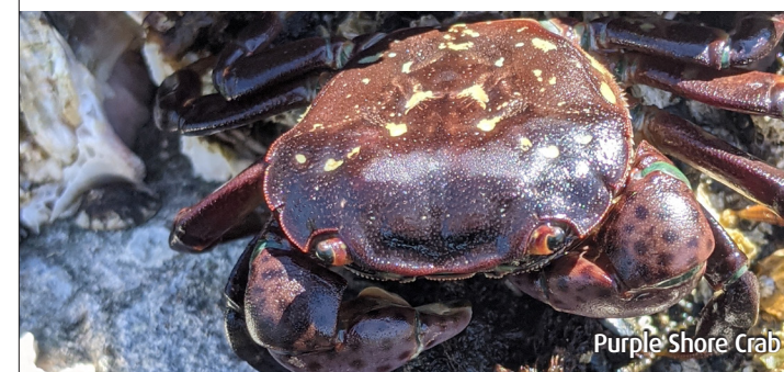
Purple Shore Crab

We can all be caretakers of the forests and beaches, as local First Nations have been for thousands of years. First Peoples believe that all living things should be respected, from insects to eagles, from bees to bears, and from cougars to crabs. As you explore, please travel lightly on these lands and be respectful of the cultures and ecosystems that depend on them.