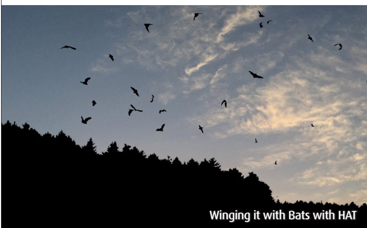
Winging it with Bats with HAT