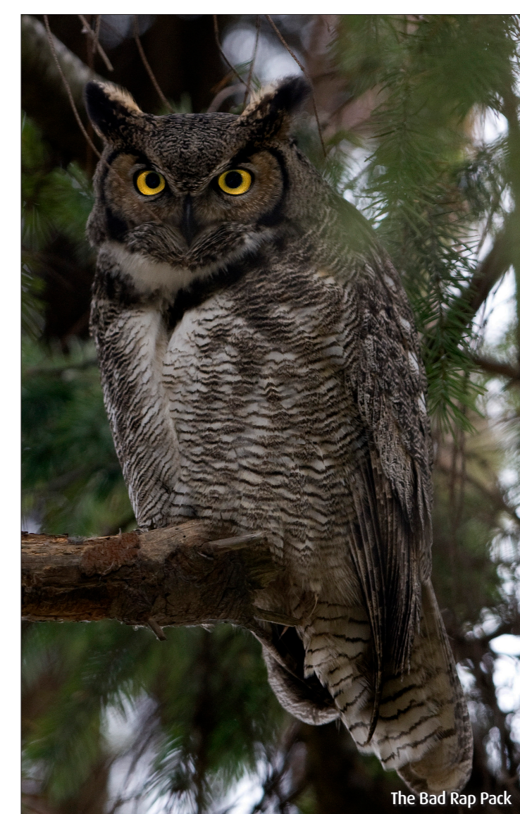
The Bad Rap Pack