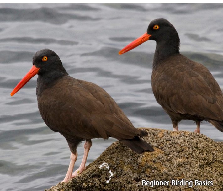
Beginner Birding Basics