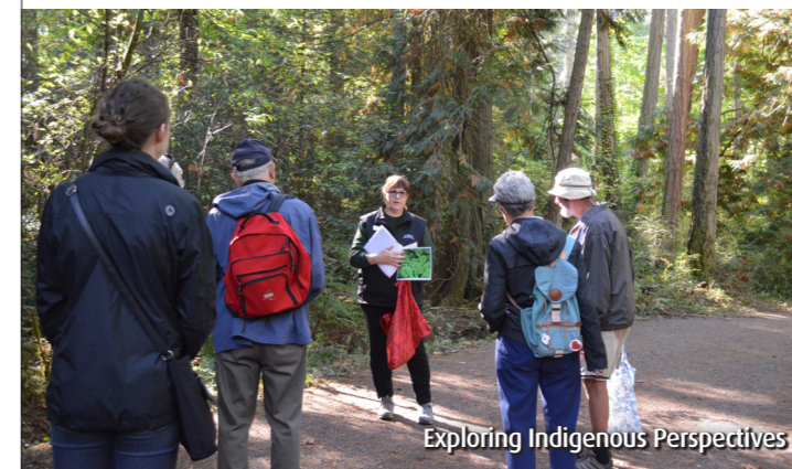
Exploring Indigenous Perspectives

Trail Description: 800m; compact surface; slight incline.