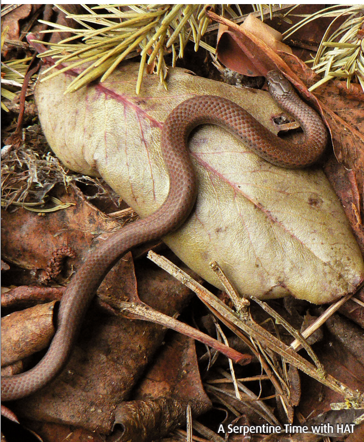
A Serpentine Time with HAT