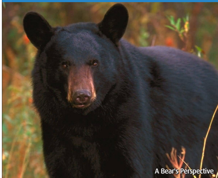
A Bear's Perspective