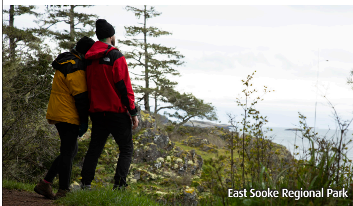
East Sooke Regional Park