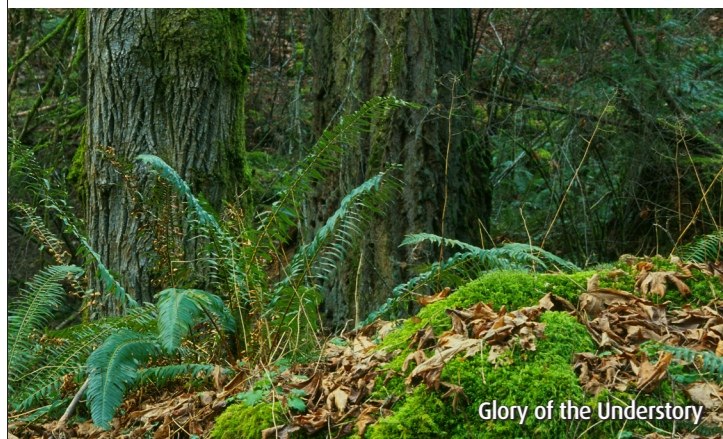
Glory of the Understory

Trail Description: 800m; boardwalk and compact surface; slight incline. Wheelchair accessible.