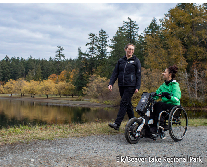
Elk/Beaver Lake Regional Park

We offer programs for a variety of ages and abilities. Brief trail descriptions can be found under each program in the brochure. For more detailed accessibility information, please visit each program's description on our website: www.crd.bc.ca/parks-events .