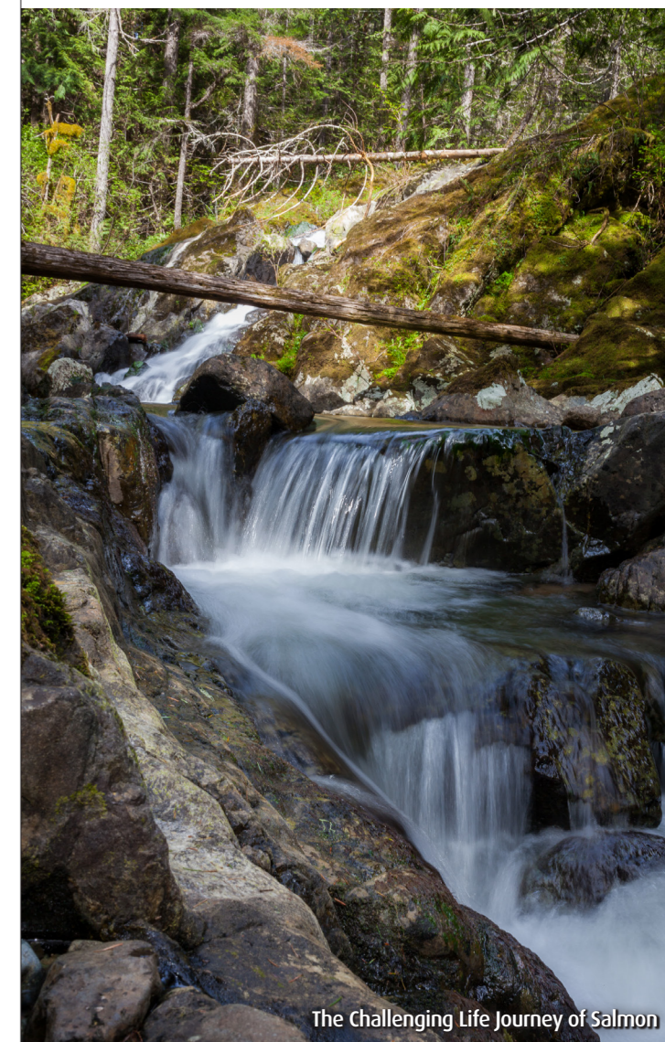
The Challenging Life Journey of Salmon

Trail Description: 1km; compact surface with roots; moderate incline.