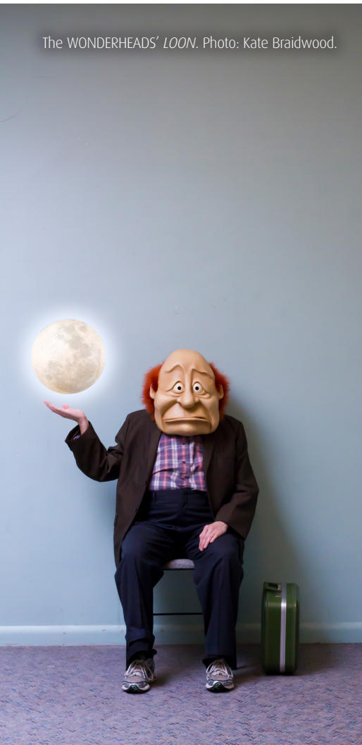
The WONDERHEADS' LOON .