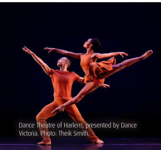
Dance Theatre of Harlem, presented by Dance Victoria.