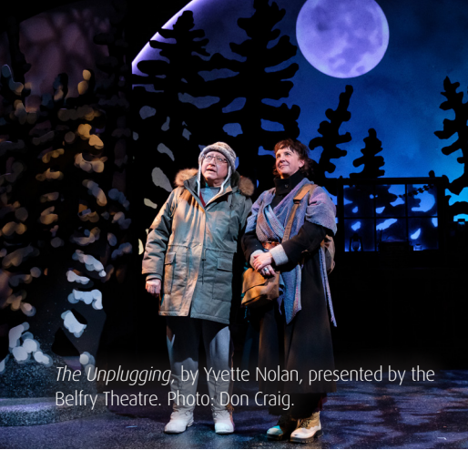
The Unplugging , by Yvette Nolan, presented by the Belfry Theatre.