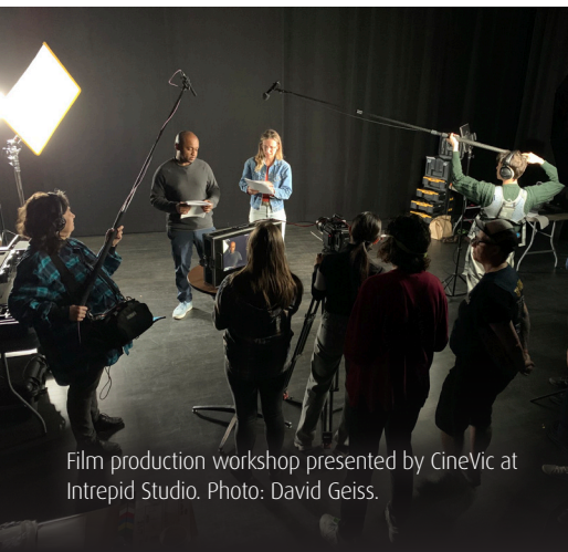
Film production workshop presented by CineVic at Intrepid Studio.