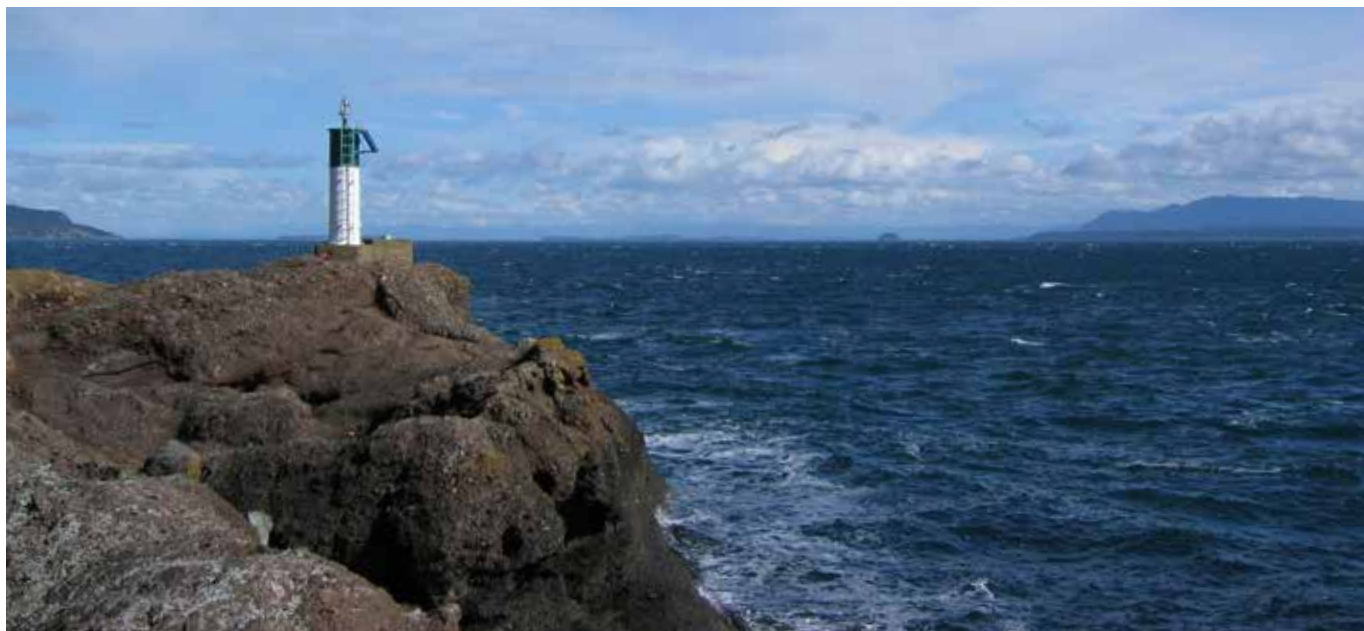
Brooks Point Regional Park

The Regional Parks Land Acquisition Fund was established in 2000 for a 10-year period (2000 to 2009) at a rate of $10 per average residential household assessment. At this time the CRD Board decided to acquire land by using money in the Fund rather than through borrowing. In 2010, the Fund was extended for 10 years (2010 to 2019), starting at a rate of $12 per average residential household assessment and increasing by $2 per year to a maximum of $20 in 2014, through to 2019. An exception was made in 2010 to make a $15.6 million acquisition of land from Western Forest Products Ltd. at Jordan River and in the Sooke Hills.