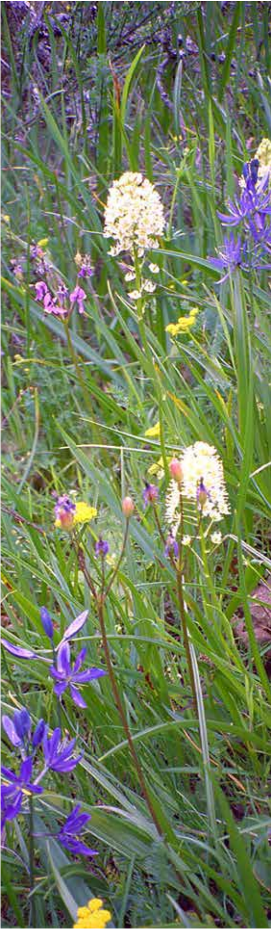
Mill Hill Regional Park wildflowers