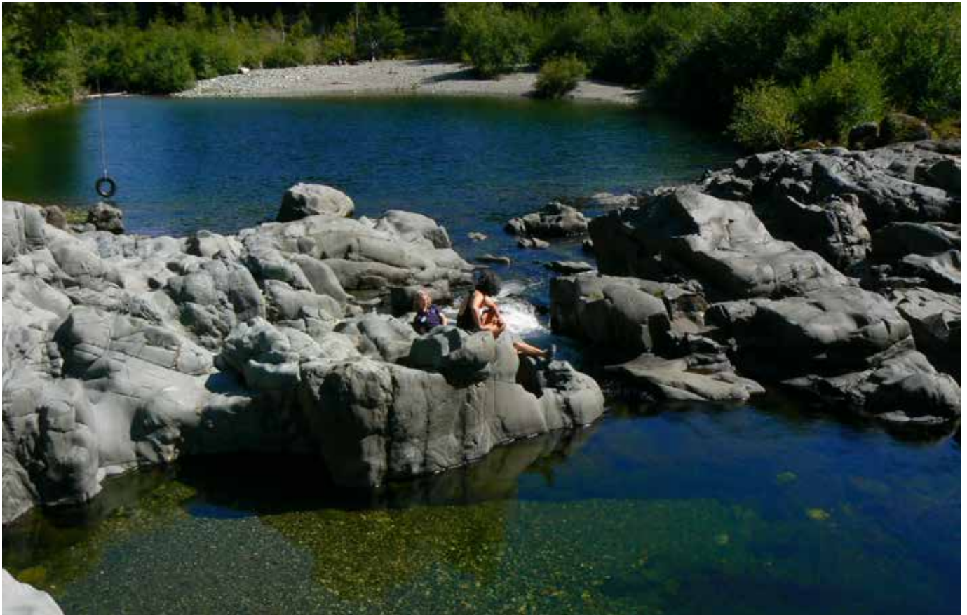
Hideaway Beach photo: D. Thiessen 2006