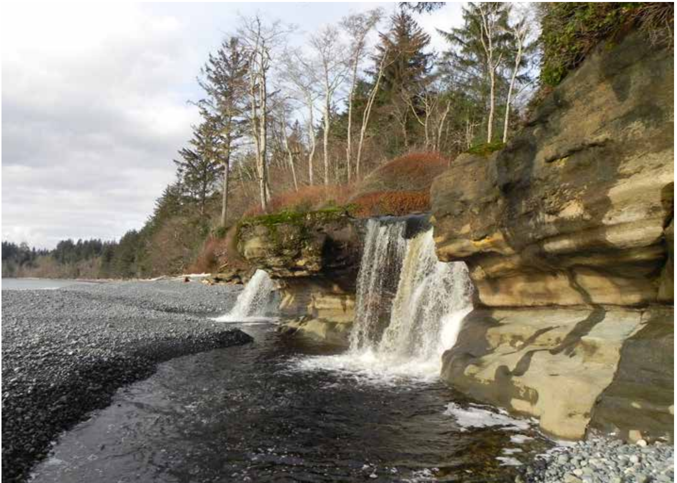
Jordan River Regional Park